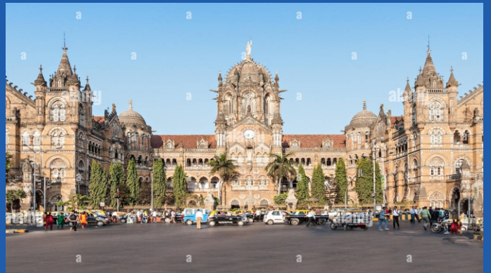
CST Railway Station