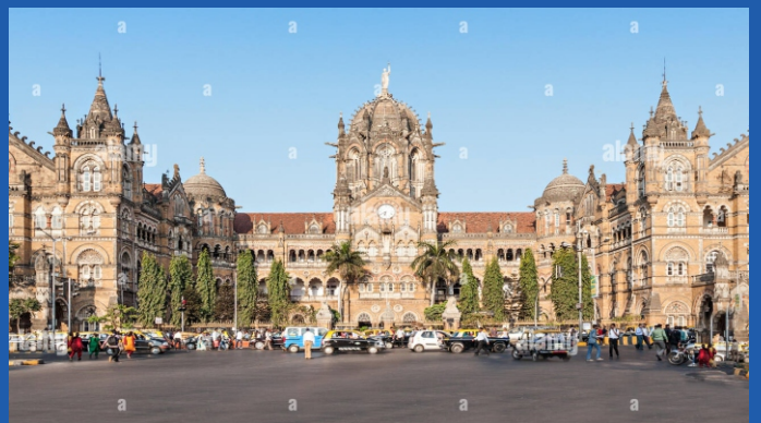
CST Railway Station